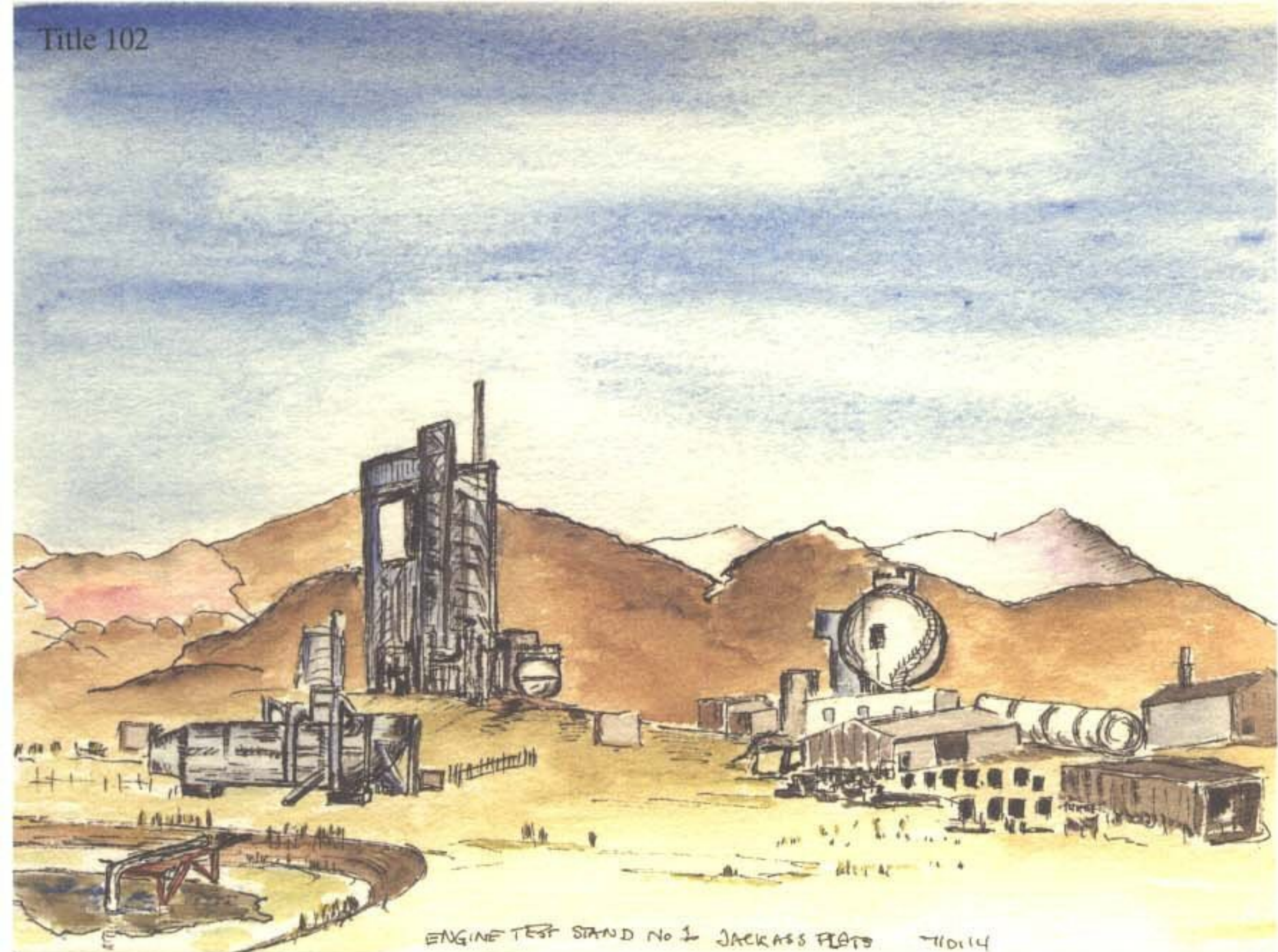
Title 102. I saw the world's most powerful atomic reactor, built to propel rockets in space, at Jack Ass Flats, Nevada, USA