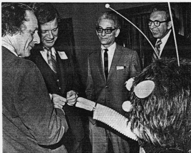
"Max the Robot" (he's the little fellow) mingles on groundbreaking day. He'll make another appearance at the open house.

Right now it is important to estimate how many people will attend. In the near future you will receive an invitation with an RSVP form attached. Please answer all the questions as accurately as possible and reply promptly.