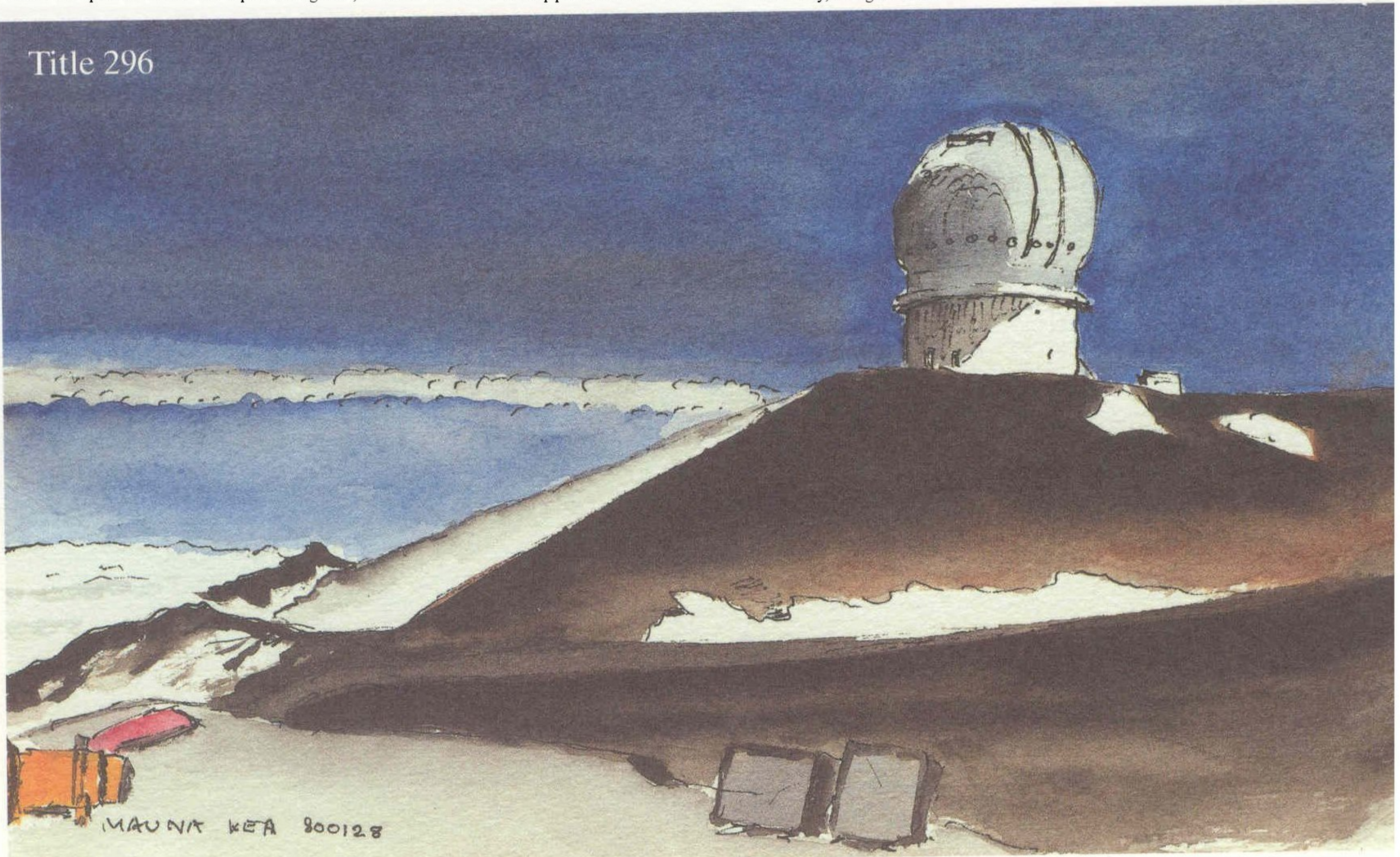
Title 296. British infrared telescope on Mauna Kea, Hawaii, 4200 m high, in the observatory