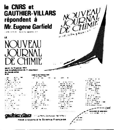
Figure 1. Advertisement announcing new French chemical journal with articles published in English.