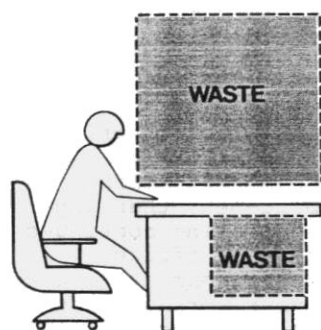
Conventional furniture wastes space.

Storage cabinets, shelves, and various work surfaces will be suspended from your partitions at different heights. Open planning will let you put a lot more stuff in an area of a given size than other types of office arrangement. The illustrations below underscore this point: