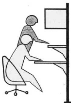
Our open plan system makes full use of vertical space.

Thanks to the highly-efficient use of vertical space, everyone will have plenty of room. Nobody will have less than 48 square feet of space to call his or her own. All offices and work areas will have more space than is called for by any accepted design standard. What's more, aisles that are at least 5 to 8 feet wide will make the work areas appear even roomier.